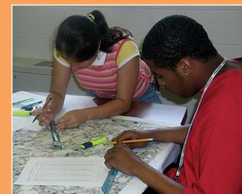
Upward Bound Math and Science