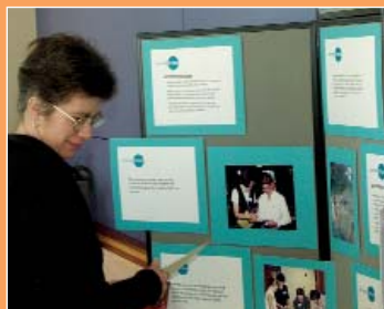
Commission for Women