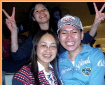
College Assistance Migrant Program