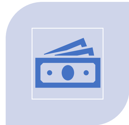
FULL FUNDING, PARTIAL FUNDING, CONDITIONAL FUNDING, NO FUNDING